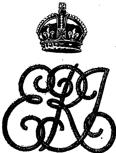
THE IMPERIAL CYPHER AND CROWN.