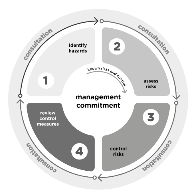
Figure 1 Risk management process

The risk management process involves four steps: