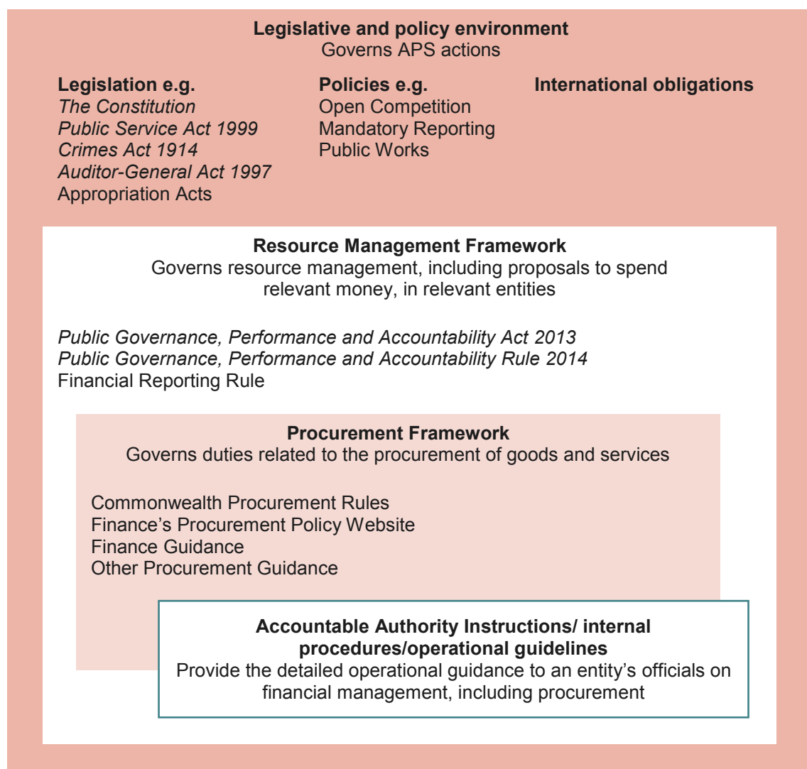
Figure 1: Legislation and policy