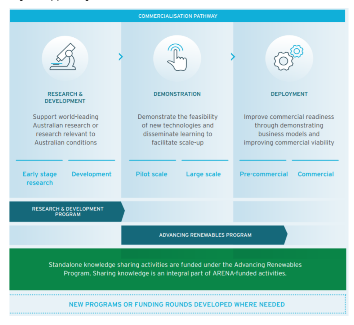
Fig 1 Supporting innovation and commercialisation