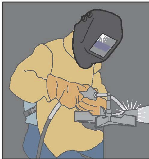
Figure 3: Welder wearing welding helmet, dry leather welding gloves and leather apron

In most cases PPE must be worn by workers when welding to supplement higher levels of controls such as ventilation systems or administrative controls (see Figure 3).