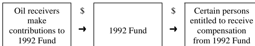
Diagram showing flow of money