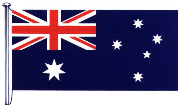
AUSTRALIAN NATIONAL FLAG